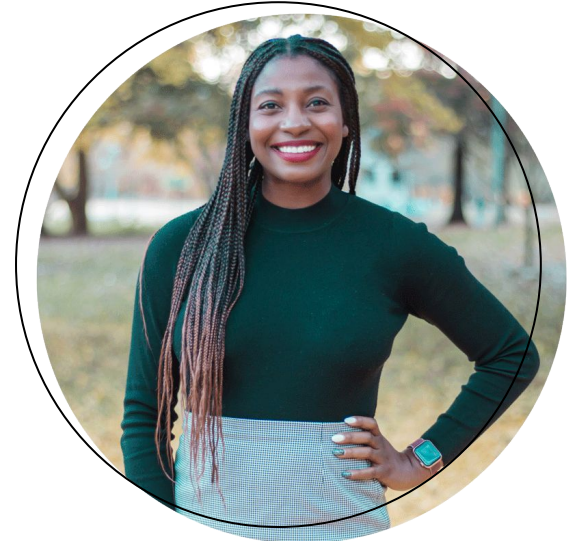
Account Executive abc@abc.com